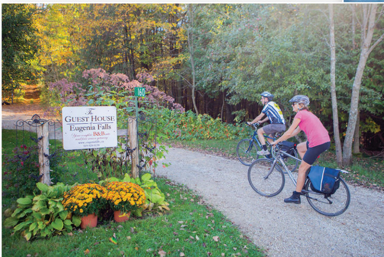
The Guesthouse at Eugenia Falls