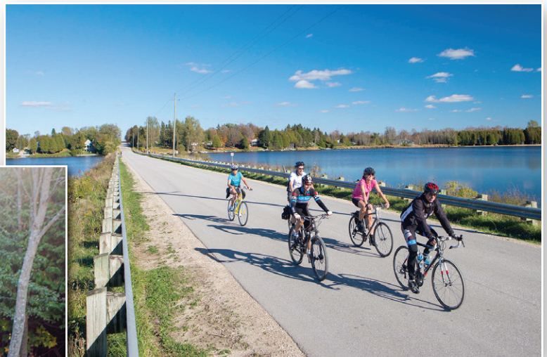
Eugenia Lake Causeway