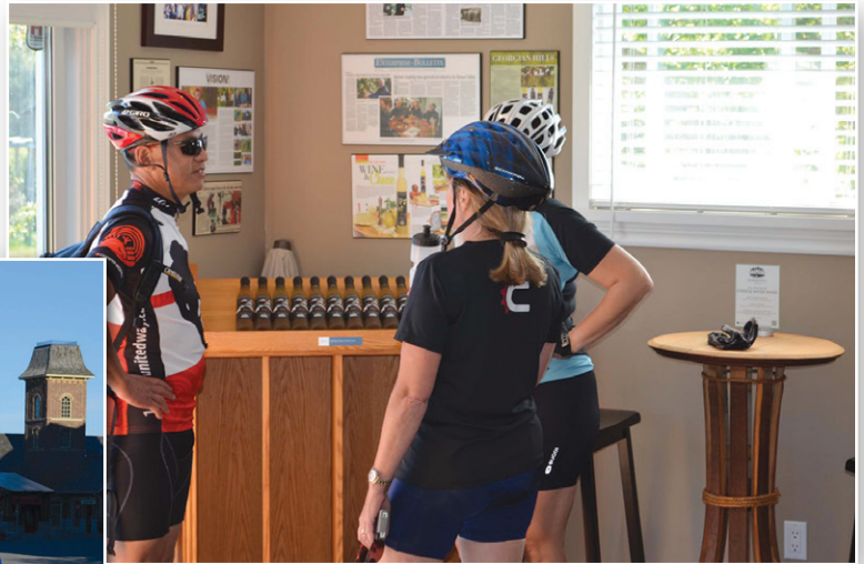
Georgian Hills Vineyards, The Blue Mountains