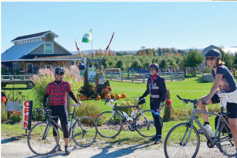
Farmers Pantry, Clarksburg

Bikeface Cycling, Owen Sound Ride on Bikes, Meaford Blue Surf, The Blue Mountains Squire John's, The Blue Mountains Cranberry Resort, Collingwood